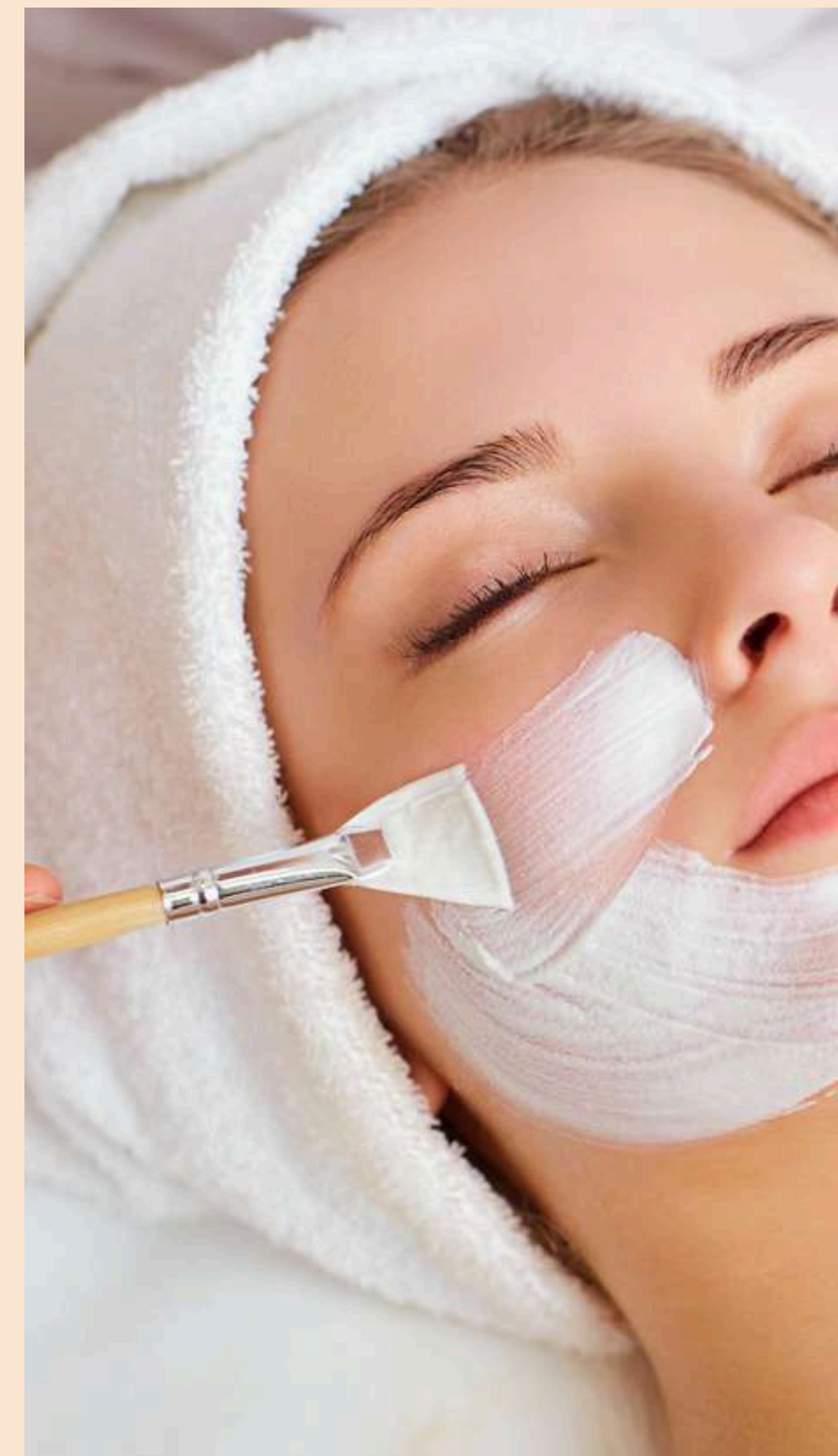
Cosmetics for sale: Scens Organic & Vegan